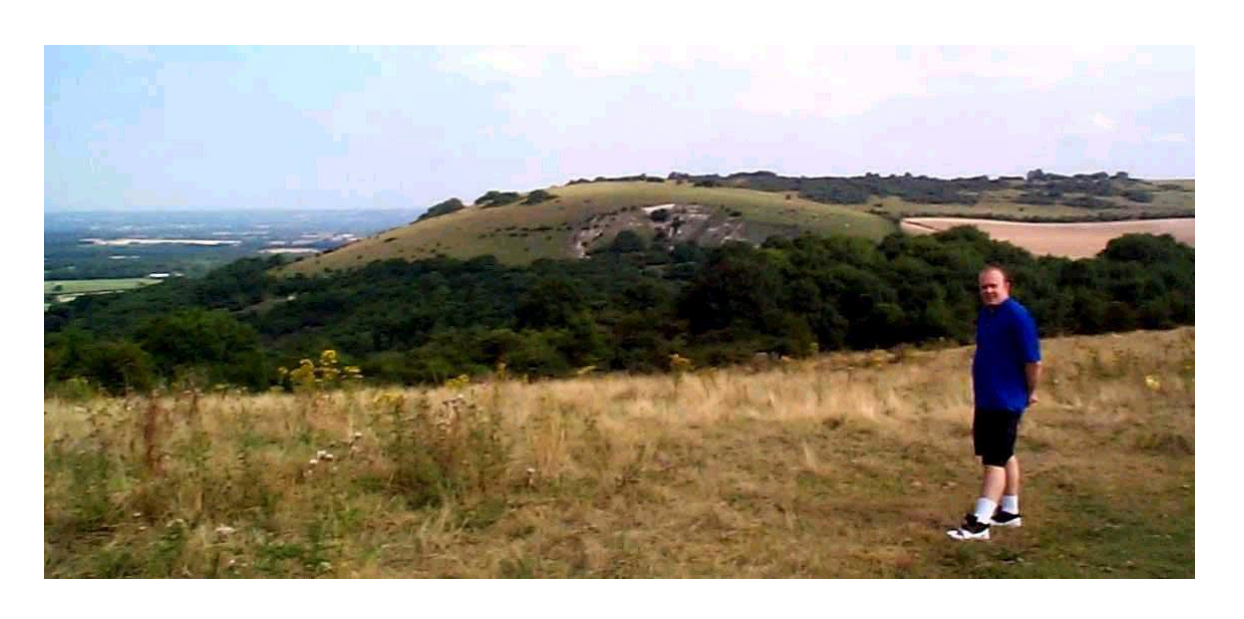
Devil's Dyke somewhere in England (UK)